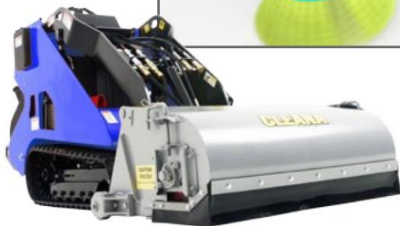
Mini Broom also available